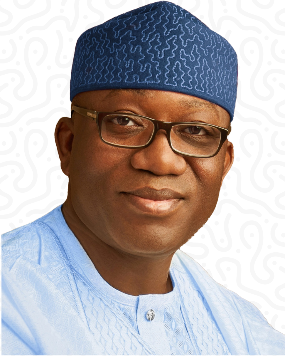
His Excellency Dr. Olukayode Fayemi Executive Governor of Ekiti State.