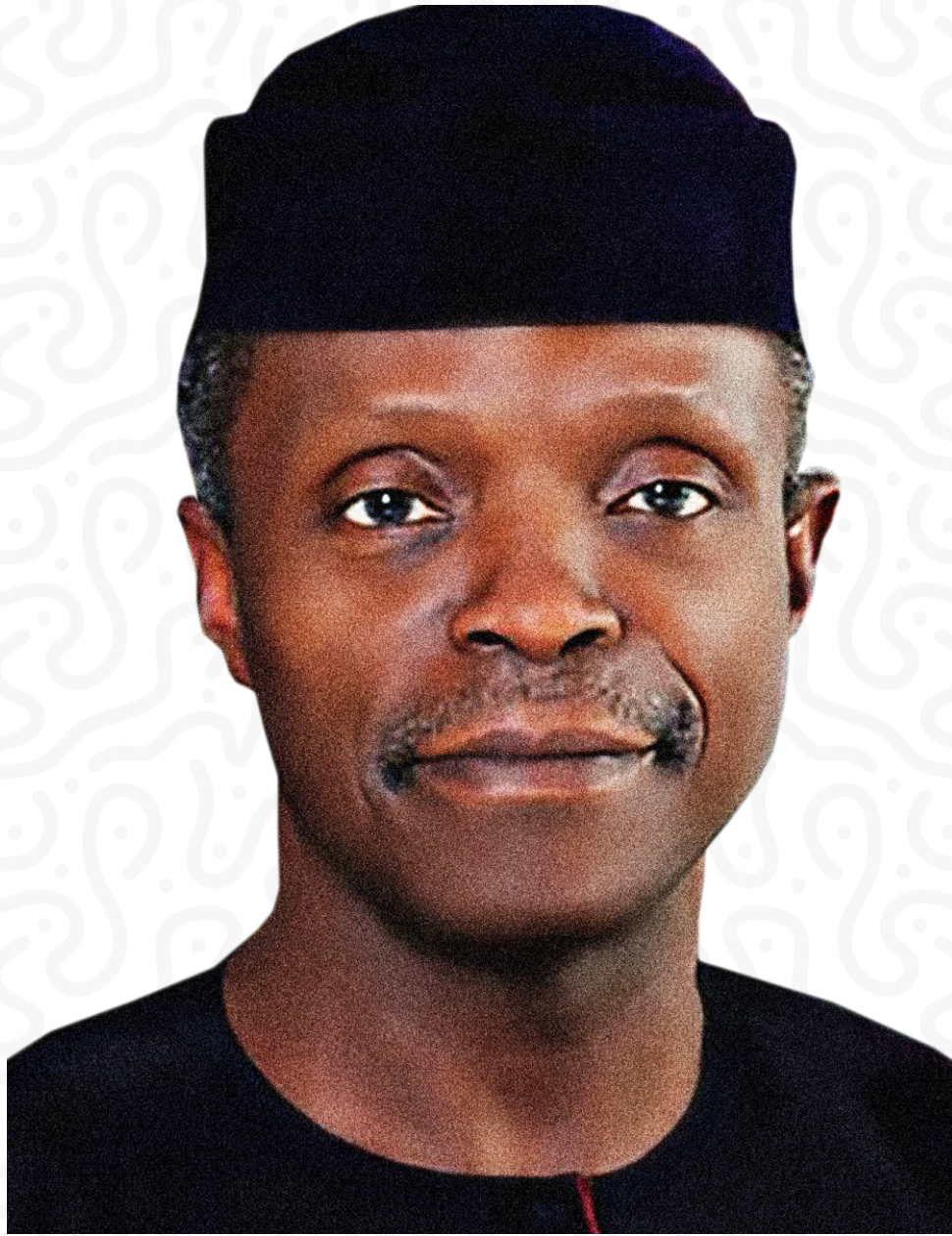
His Excellency Prof. Yemi Osinbajo, SAN, GCON Vice President, Federal Republic of Nigeria