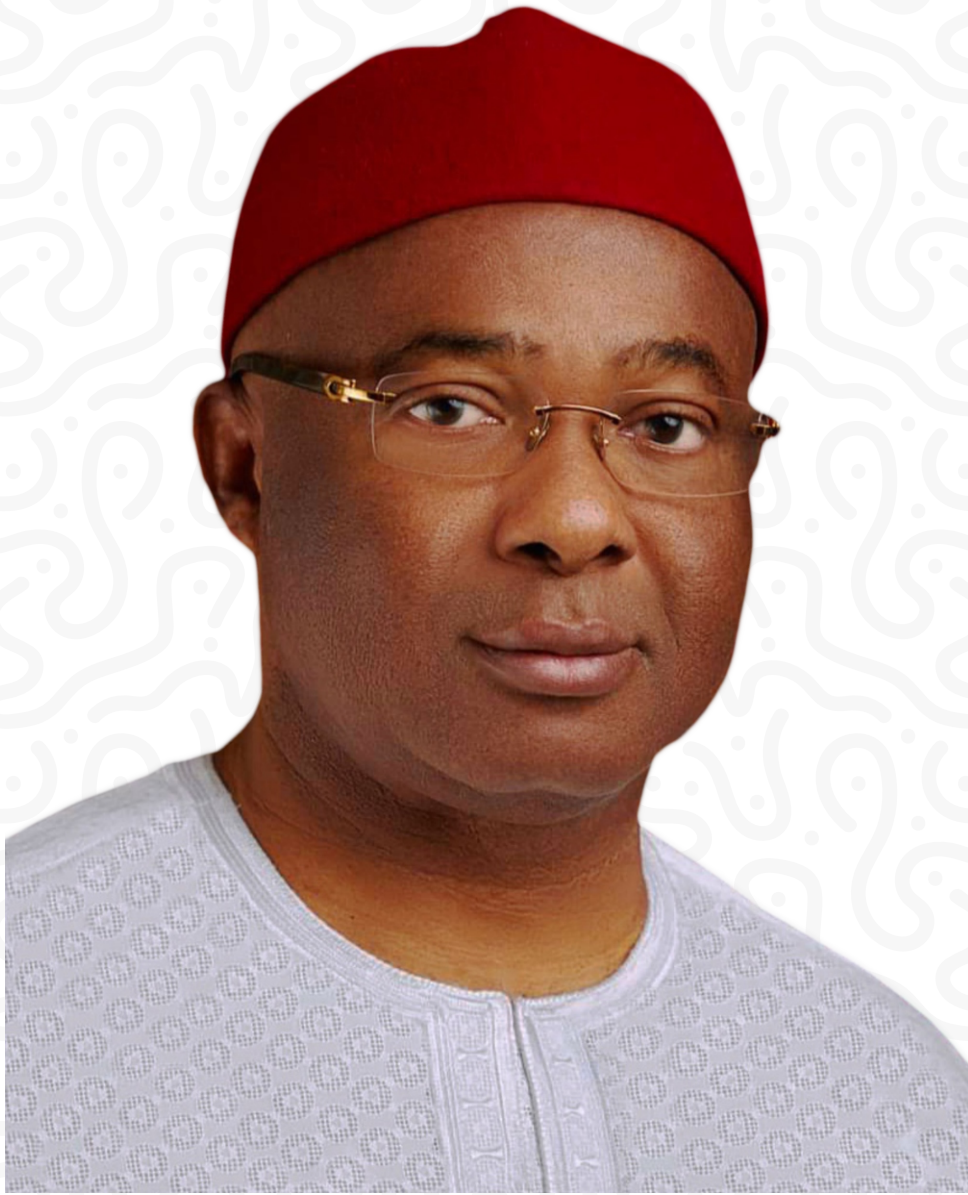
His Excellency Senator Hope Uzodinma Executive Governor of Imo State